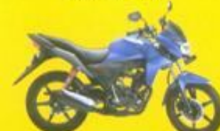
Pearl Fiji Blue