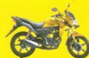
Electric Yellow Metallic

Standard version with Self Drum / Kick Drum also available.