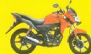
Pearl Siena Red