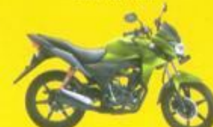
Candy Palm Green

1. CB Twister meets Bharat Stage III Norms. 2. *Based on Indian mode - Internal Honda riding mode based on various simulated actual riding conditions. 3. +The technical specifications and designs of bike shown here may vary according to requirements and subject to change without any notice. 4. Accessories shown in the picture may not be part of the standard equipment.